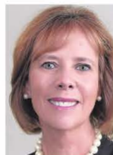
Gail L. Letts Humanitarian Award