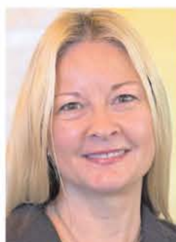
E. Ayn Welleford Humanitarian Award