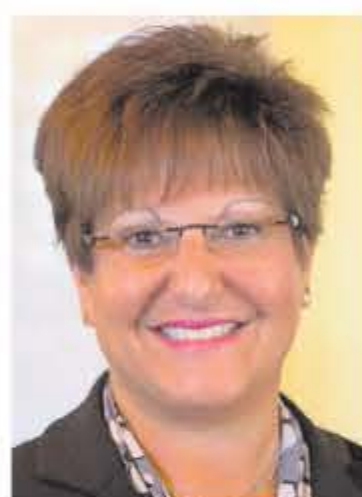
Susan W. Adolf Humanitarian Award

WHERE: Hilton Richmond Hotel & Spa/Short Pump, 12042 West Broad Street