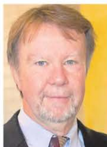
William A. Harrison, Jr. Humanitarian Award