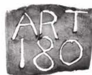
ART 180 Distinguished Merit Award

ART 180 builds community. It brings people together who might not normally intersect, and it encourages them to communicate—through their art, and through conversation. Founded in 1998, ART 180's mission is to give young people in challenging circumstances the chance to express themselves through art, and to share their stories with others. Targeting the most vulnerable youth, ART 180 uses art as a means for positive youth development, building resiliency and linking individual growth with the emergence of social responsibility.